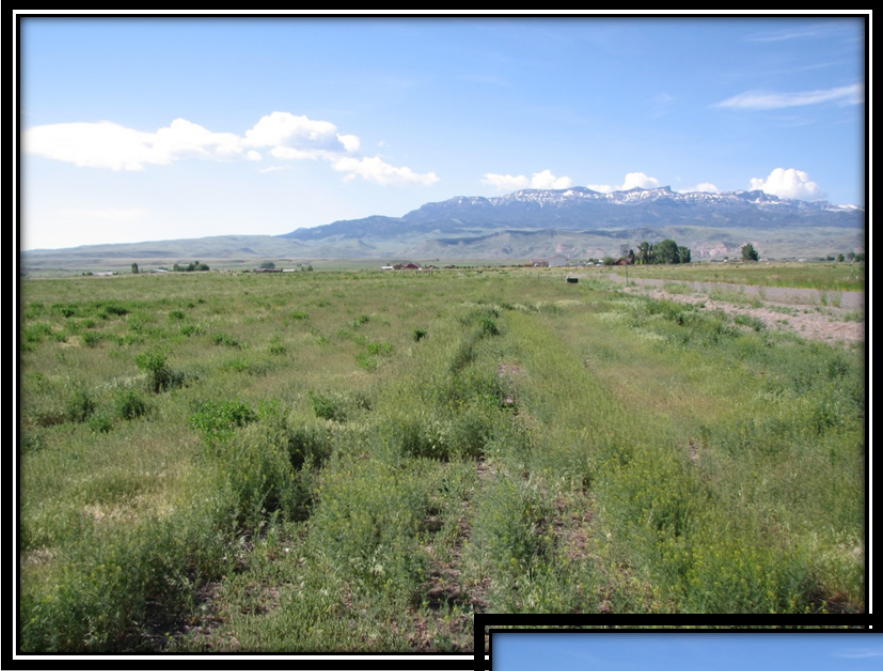
View West Sheep Mountain